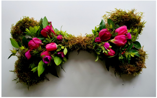
A mossed, bone shaped tribute, from the dogs.